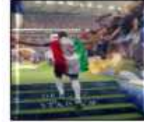
Ali Daei AhmedReza Abedzadeh Mehdi Taremi Sardar Azmoon and...