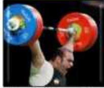
Hossein Rezazadeh Behdad Salimi Kianoush Rostami and...