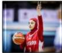
Hamed Haddadi Samad Nikkhah and ...