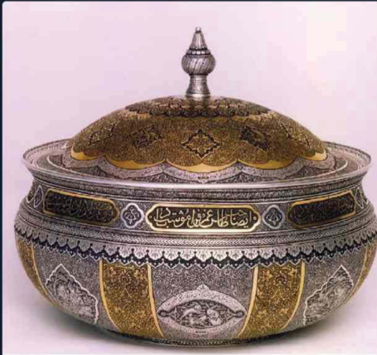
Persian engraving (ghalam-zani)