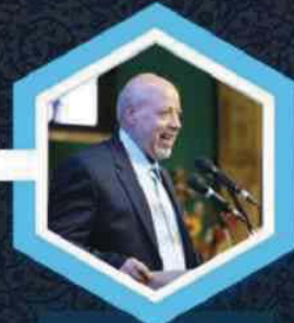
Abbas Rezaei Governor of Isfahan