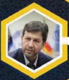
Mehdi Jamalinejad Deputy Minister of the Interior