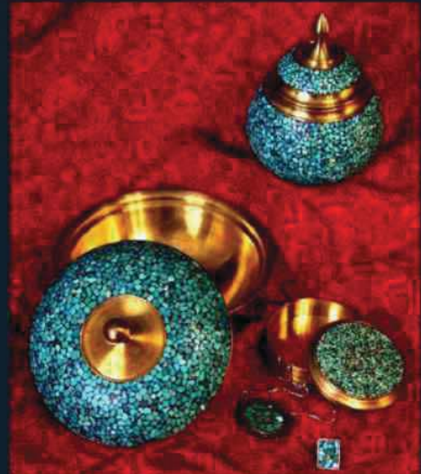
Turquoise Inlaying (Firoozeh-Koobi)