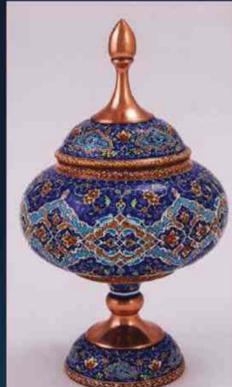
Persian Enameling (Mina-kari)