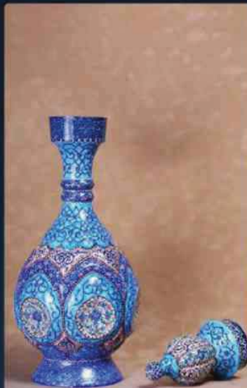
Persian Enameling (Mina-kari)