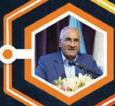
Ghodratollah Norouzi Mayor of Isfahan